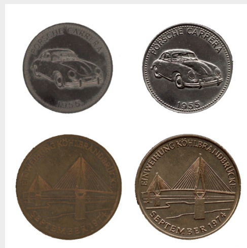
2D scan versus 3D scan, capture all details